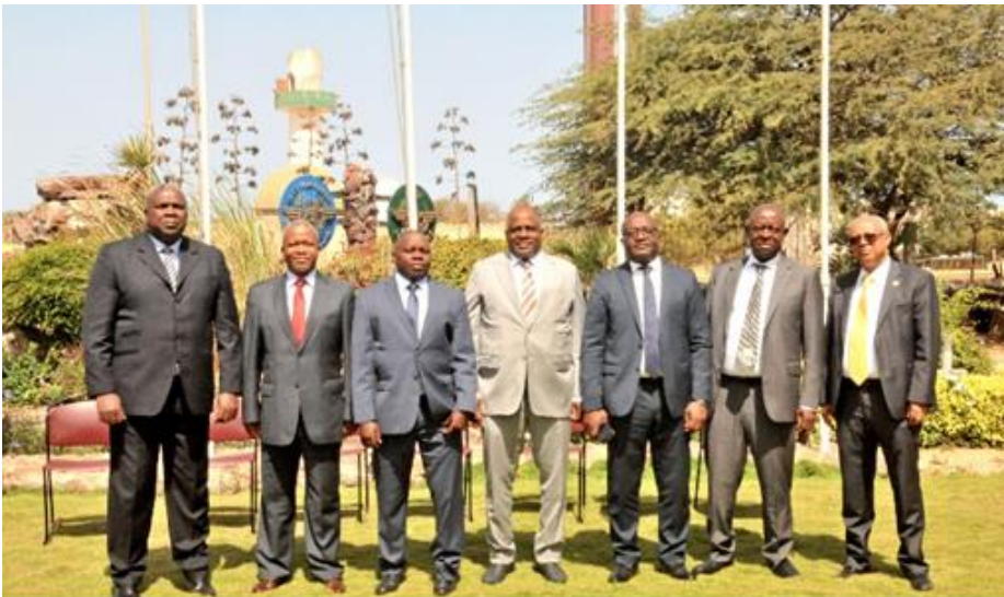
123 rd AFCAC BUREAU MEETING AFCAC HEADQUARTERS, DAKAR, SENEGAL, 1-3 APRIL 2019