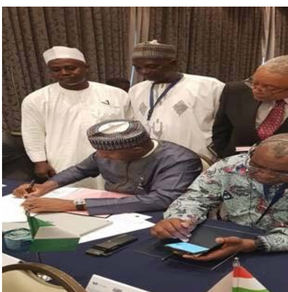
• The Minister of Nigeria (left) and the Minister of Burkina (right) signing the Memorandum of Implementation