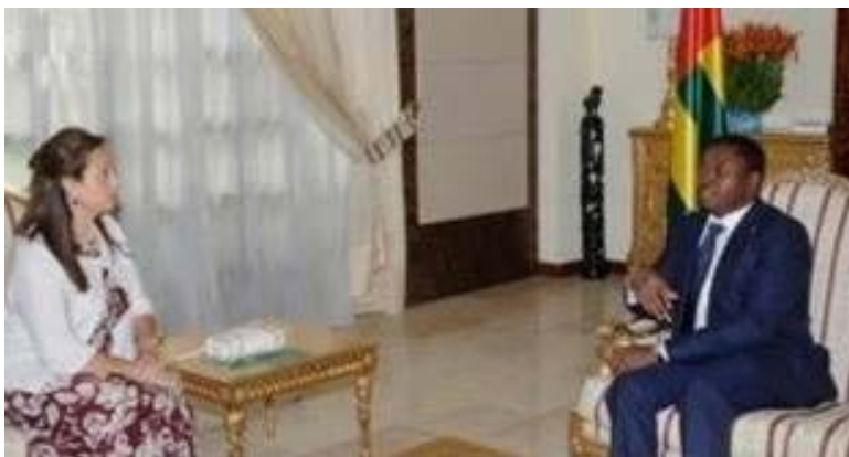
• The AUC team led by the Commissioner of Infrastructure of AUC also met H.E, President of TOGO with the team of AFCAC to discuss issues related to the Status of implementation of the SAATM.