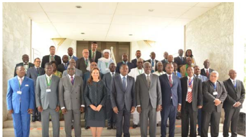
The SAATM Champion – H.E. Faure Gnassingbe, President of Togo and other delegates at the fourth Ministerial Working Group (MWG) on SAATM held between 25th - 28th May, 2018 in Lome, Togo